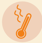
Fever and chills