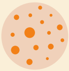
Skin changes including a rash or sores

Mpox symptoms can include a rash, spots, or blisters. Some people also develop cold and flu symptoms, including a fever or swollen glands.