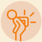
Back, muscle and body aches